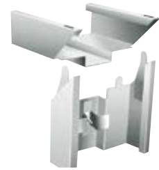
Knock-Down (KD) assembly with tabs and compression anchor