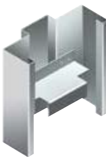
Steel stud "Z" bracket anchor (ZBA), welded