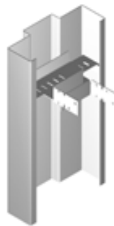
Multi-purpose wood or steel stud anchor (SWS)