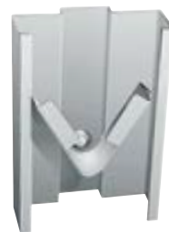
Existing wall anchor (EWA) with reinforcement welded